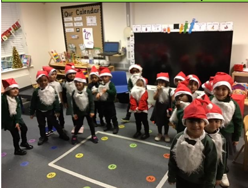
They were very excited to meet Santa!

Nursery have had another busy half term, ending with a fabulous Christmas performance. The children worked hard to create some Christmas cards and calendars for their parents. These were shared with parents after our Christmas songs. The children were fantastic!