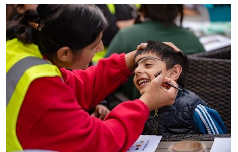
Garden Party 2019